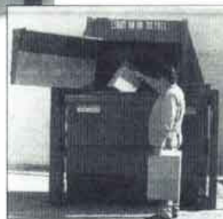
Easy open door Front feed shown is standard