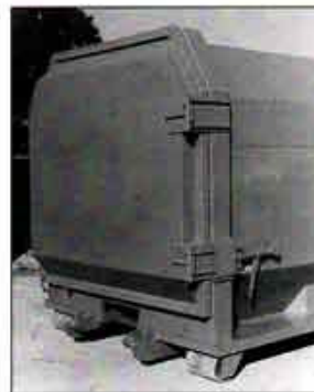
Heavy-duty ratchet latching mechanism aids water tight sealing of both sides of rear door