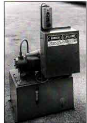
Pressure Switch Power Unit for Simplicity. Tri-Voltage Power Supply-208, 230 or 460 Volt 3 Phase. 100% Full Container Light.

Unique rear door design and extra-heavy hinges insure long maintenance-free life of the Dura-Bilt Space Squeezer Compactor